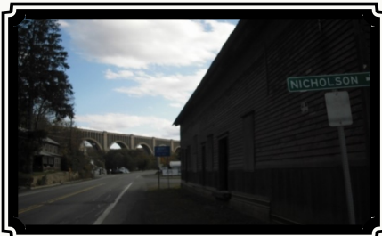
Station — Present Day