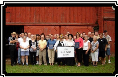
125th Wilbur Reunion – 2011