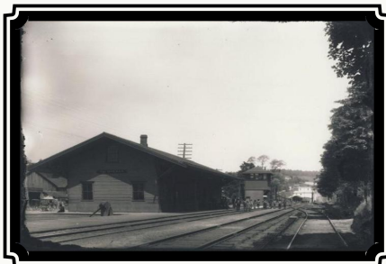
Station — Turn of the 20th Century