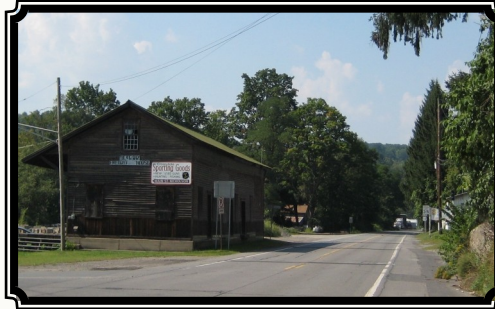
Station – 2010

The Nicholson Heritage Association would like to thank everyone who voted in January for our Pepsi Refresh Project grant submission to renovate and restore the historic 1849 railroad station in Nicholson into a community center. The railroad station was built by the Liggett's Gap Railroad, one of the Delaware, Lackawanna and Western Railroad's (DL&W) predecessors.