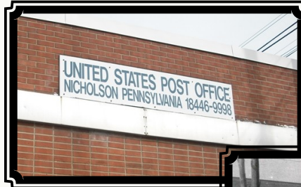
Nicholson Post Office Present Day

Nicholson Post Office Corner of Main & Walnut Streets